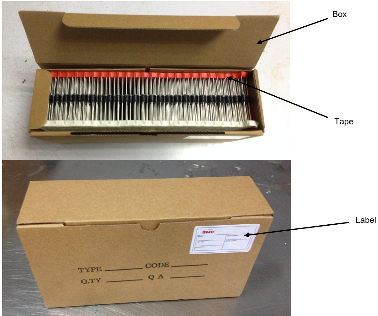
Fig.1- Reel pack for Axial Lead